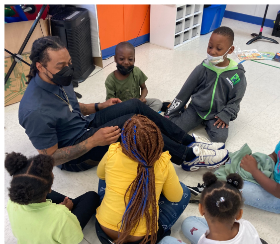
Wordsmith working with students at The Belair Edison School