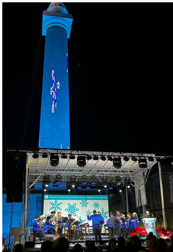
Left to Right: The Martinez Trio at Highlandtown, Primo High Brass (top) and Primo Cellos (bottom) at Mary Ann Winterling, and the Latin Ensemble at the Mt. Vernon Monument Lighting